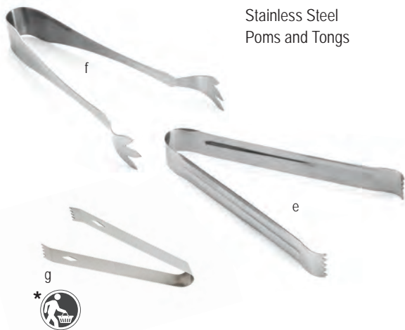
Stainless Steel Poms and Tongs

Features drain holes to prevent melted ice from watering down drinks