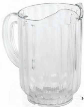
Crystal Clear SAN Plastic

*Available as Cash & Carry † Hand wash only